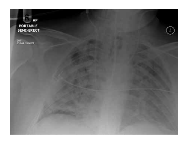
Figure 3. Chest X Ray of patient 3 in the previous 24 hrs prior to ECMO initiation

During the first 48 hours, oxygen saturations remained about 85% while the patient developed IAH progressing towards ACS with pressures up to 38 mm Hg. Supportive therapy included antimicrobials, total parenteral nutrition and CVVH. IAH had resolved by day 5. A tracheostomy was performed on day 8 and he was weaned off ECMO after 219 hours.