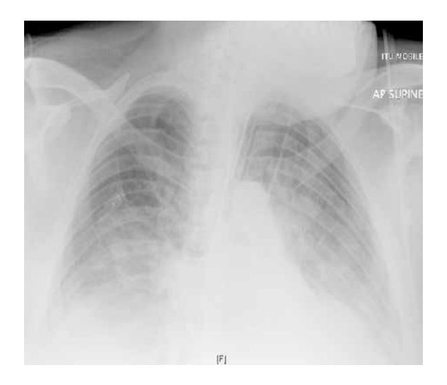
Figure 1. Chest X Ray of patient 1 in the previous 24 hrs prior to ECMO initiation