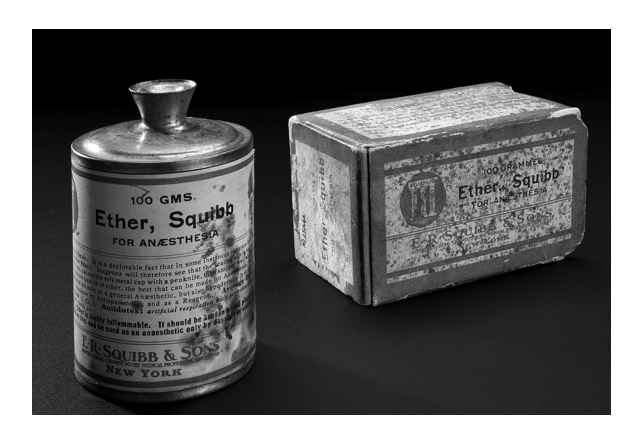
Figure 4. A metal bottle of ether.

"Gazeta Krakowska" of 9 February 1847, i.e. three days after the attempts with general anaesthesia. It is worth remembering that the journalist's report published, although in-depth, was intended for a wide range of readers and was not strictly medical, therefore lacked many medical details relevant for historians. Nevertheless, an attempt can be made to reconstruct the idea lying behind when Bierkowski decided to perform a clinical experiment with ether on 6 February 1847 (Saturday afternoon) (Fig. 4). In the presence of Professor Ignacy Czerwiakowski, physicians and students, Bierkowski performed a two-stage surgical procedure. In his characteristic and outstanding manner, he started the demonstration administering ether anaesthesia firstly to two students of the Faculty of Medicine to determine the sensitivity to pain and to calculate the time of anaesthesia and recovery. According to "Gazeta Krakowska", "Firstly, two students volunteered to take part in the attempts at producing this kind of anaesthesia. The sequence of events was as follows: A.O., a candidate of medicine, breathed with ether vapour for one minute and 47 seconds, which left him stupefied; his eyelids were spontaneously heavy with sleep and his sensations were