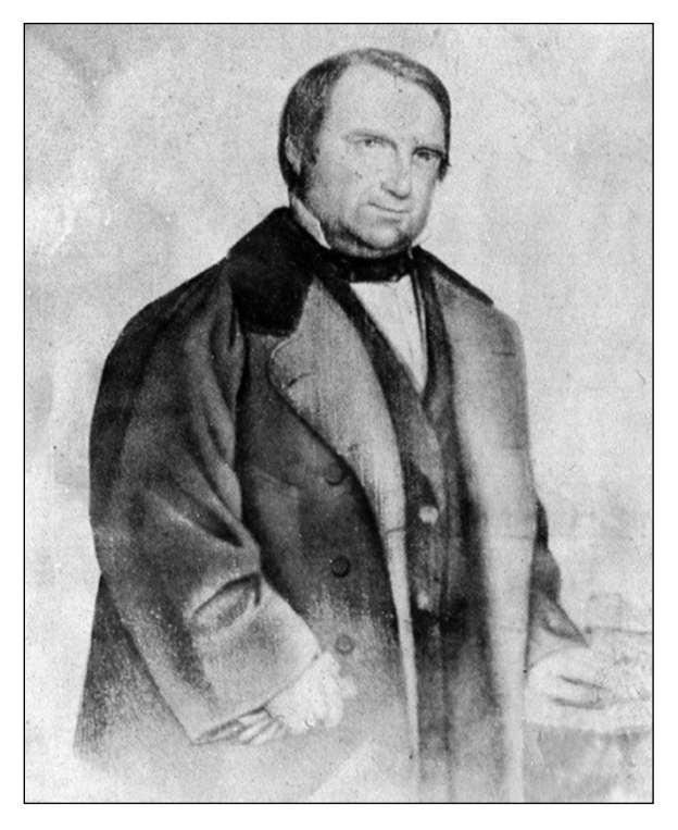
Figure 1. Professor Ludwik Bierkowski about1850 (author unknown). Collections of the Chair of History of Medicine

Dieffenbach in Germany, not to mention many others, tested the possibilities of general anaesthesia, outlining new trends in practical medicine [2, 3]. Ludwik Bierkowski, a Polish surgeon, was also among the pioneers (Fig. 1).