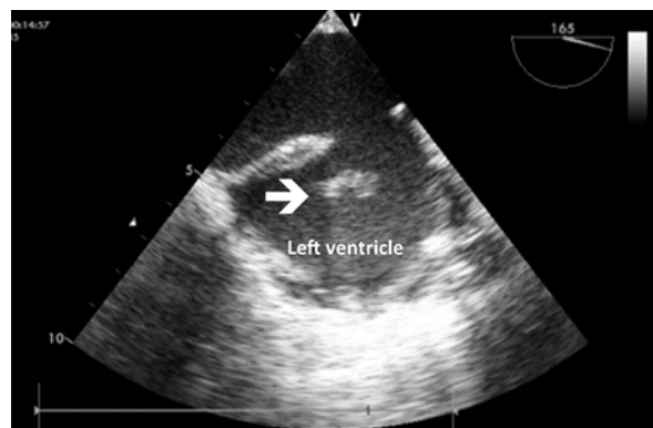
Figure 2. Echogenic thrombus formation in the left ventricle

Należy cytować wersję: Tolga Saracoglu K, Saracoglu A, Cevik A, Haluk Kafali I. Missing atrioventricular echogenic mass during paediatric HeartWare® implantation. Anaesthesiol Intensive Ther 2017, vol. 49, no 2, 174. doi: 10.5603/AIT.a2017.0018 .